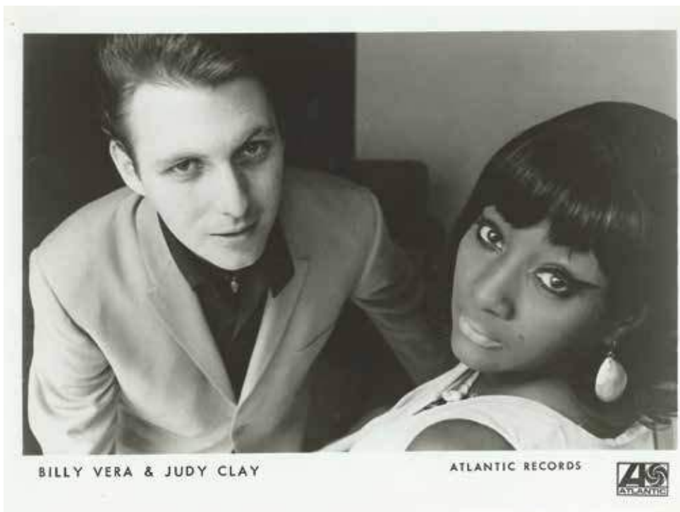
Billy Vera e Judy Clay